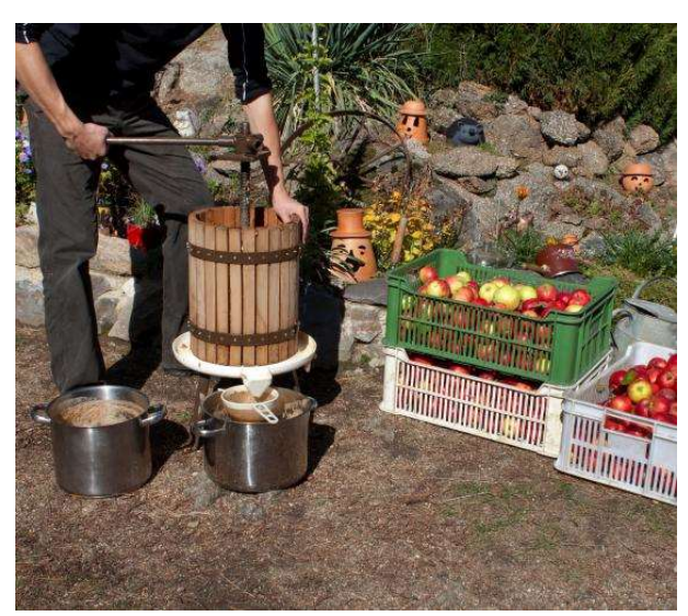
All you need to do is bring along your apples and some clean containers (empty milk cartons or pop bottles). Instructions will be provided about storage of the juice.

On Sunday September 25<sup>th</sup>, the same day as the Village Lunch, there will be the opportunity for villagers to bring their apples to the village green for juicing. Stephen Watts from Coed Hills will be bringing his equipment to scrat (pulverise) the apples and press them to extract the juice.